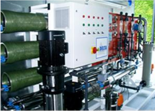
Reverse osmosis plant in Romania