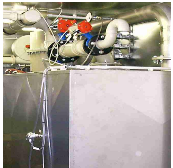
Section of DELTA KAT 500, VW Hannover

The application at VW Nutzfahrzeuge Hannover GmbH with a very high VOC contamination and the remediation of the former Lankwitzer lacquer producing plant with a high BTEX contamination are examples for the integration of thermic catalytic oxidation.